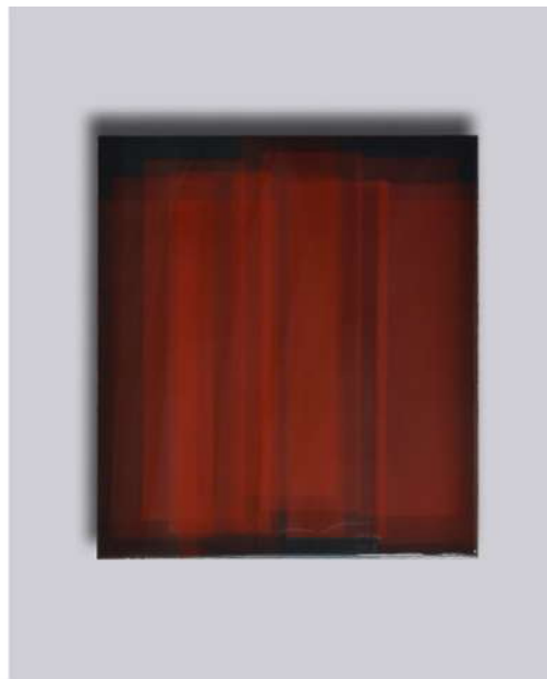
Left: Dirk Salz – Untitled 2197, 2012 / Right: Dirk Salz – Untitled 2151, 2016